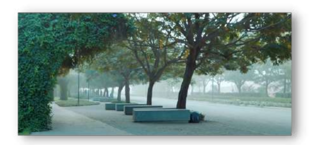
In Midst of Nature